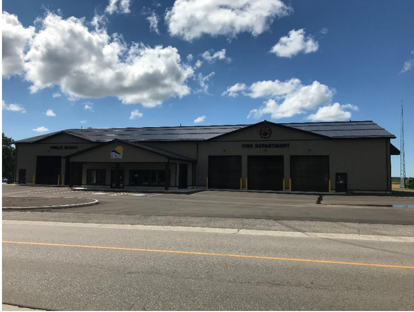
Blyth Fire Station