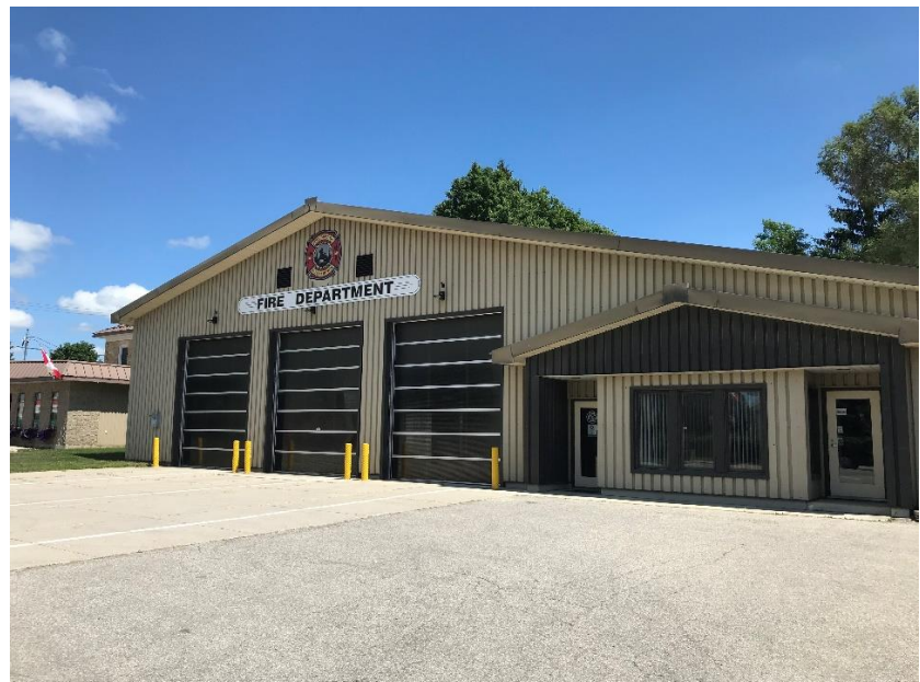
Wingham Fire Station